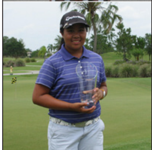
FJT at Old Corkscrew GC (16-18) April 28-29, 2012