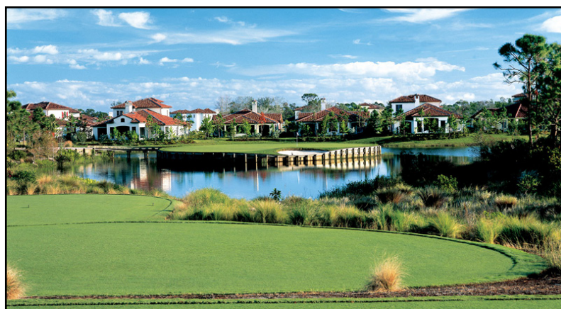
Ritz-Carlton - Jupiter